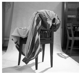
People and Archives