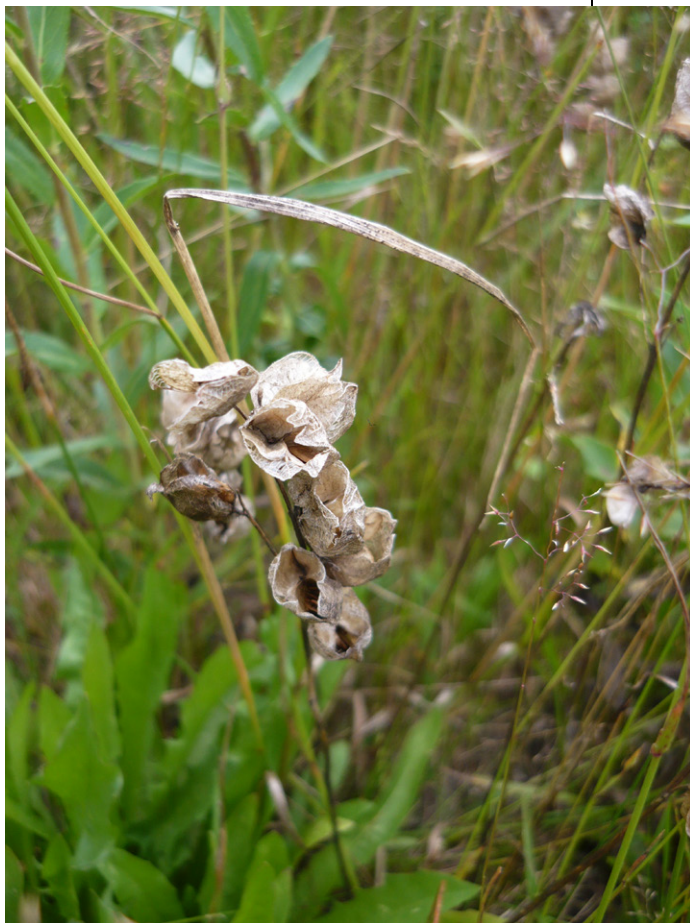
Fig. 6. A fully ripened Rhinanthus sp., indicating the optimal time for mowing.

could begin is rattle Rhinanthus sp., called clocotici in local speech (Fig. 6). The local expression când sună clocoticiul (literally, when the rattle rattles) was used to signal that hay mowing could begin. Today, when Rhinanthus “rattles”, it is a sign that the hay is over ripened and it is a bit late for mowing. Rhinanthus sp. is still used to monitor the hay, but mowing starts when its fruits are not yet fully ripened.