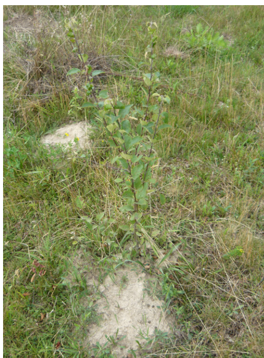
Fig. 10. A wild apple tree ( Malus sylvestris ) left to grow on a mowed meadow.

The clearing of unwanted woody vegetation around the Fast of St. Mary (August 14 th ) is a method also used for the suppression of the invasive species black locust Robinia pseudoacacia from the meadows, another method is called in local speech ciungit , i.e. striping the bark from the trunk and leaving the tree to dry out.