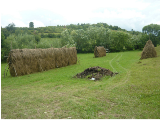
Fig. 7. Drying cultivated hay on jârâzi and old manure - mranîţă (center) on a low meadow ( mejdele de jos ).