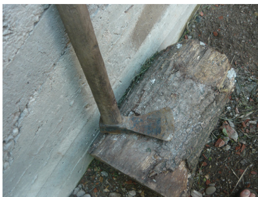
Fig. 2. A special hoe ( sapa de laz ) is used for cleaning the meadows of unwanted vegetation.

Ensuring the good condition of hay meadows is crucial and their management implies several stages and various practices, summarized in Table 2. Though mowing is their main use, depending on the stage of the vegetation regrowth, animals are sometimes allowed to roam on the hay meadows in certain months.