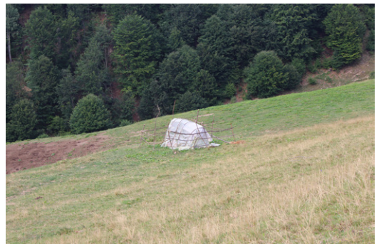
Fig. 4. Traditional tent ( cort ) made out of hazelnut trees and covered with nylon (not hay anymore), used by shepherds on a high meadow ( mejdele de sus ).

with a cow to start mowing before the shepherds return with the animals from the alpine pastures. This practice is called mers de mas , meaning going and staying overnight on the upper meadows; for this purpose, a small shelter, a tent ( cort is the local name for this structure), is built from hazelnut branches (Fig. 4) and covered with