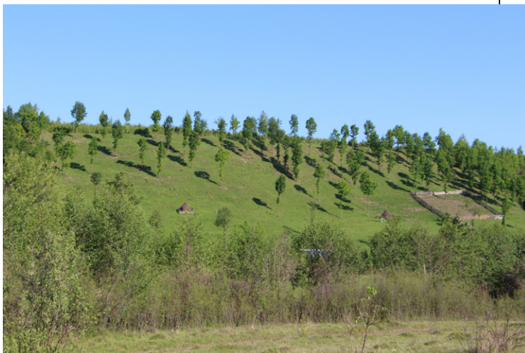
Fig. 9. Wooded and pollarded meadow, haystacks and a sheep corral are also visible.

Grazing is also part of the traditional practice system used for hay meadows, animals being left to roam after the hay has been cut and haystacks have been made. Therefore, sheep, cows and horses are usually grazing all over the areas where the crops have been harvested, meadows being no exception in this sense. This is a practice that is said to improve the quality of the grass because the animals also manure the fields while grazing them. This type of grazing is done in two phases, the first one in late winter and early spring, when the young grass has sprung up, and the second in autumn after the crops have been harvested. Intensive grazing in corrals is sometimes applied to control unwanted vegetation (Fig. 9), this method being especially used to suppress Nardus stricta and the various Carex spp. The success of this method does not consist in the grazing, but in the intensive trampling and manuring done by