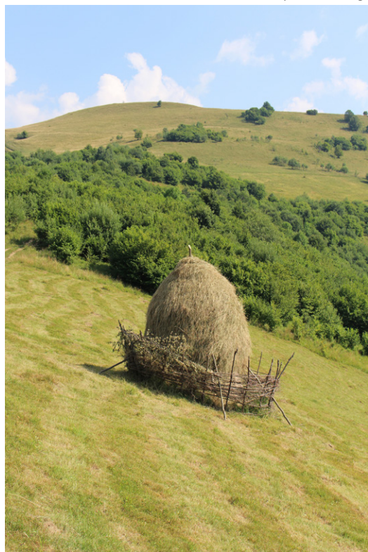
Fig. 5. Barred haystack on a middle meadow ( mejdele de mijloc ).

Monitoring the hay is an active practice, since the phenophases of the plants are used to determine the best time for mowing. Therefore, along with the other landmarks, like the feast of Saint Peter and Saint Elijah, plant phenology is used as a reference. The plant species traditionally monitored to determine when hay mowing