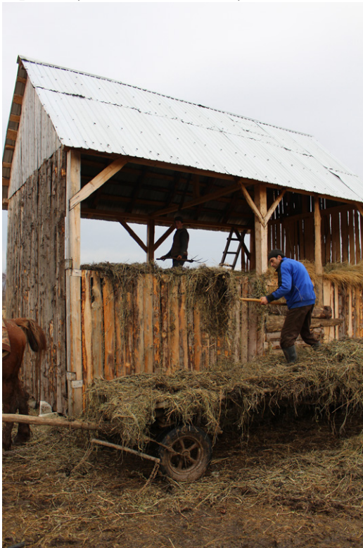
Fig. 8. Unloading hay into a barn ( şopru ).

home, or to the temporary shacks ( colibe ) in the fields, with carts, where they are used for the indoor feeding of the animals. During harsh winters, the locals used to form convoys of horse-drawn sleighs and had to make their way through the thick snow of the upper meadows with shovels to reach the haystacks. The hay is stored in special buildings, şopru (Fig.8). Usually good quality hay and second grass are kept separately from the other hay.