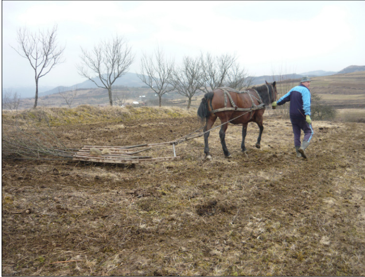
Fig. 3. Spreading manure with the harrow and thorn bushes.

The following work on the meadows is the breaking up of manure with the harrow (Fig. 3). Thorn bushes are bound after the harrow and big stones are used on it as weights. This way, manure is evenly dispersed all over the meadow or field. The next step is the scattering of hayseeds, followed occasionally by grazing.